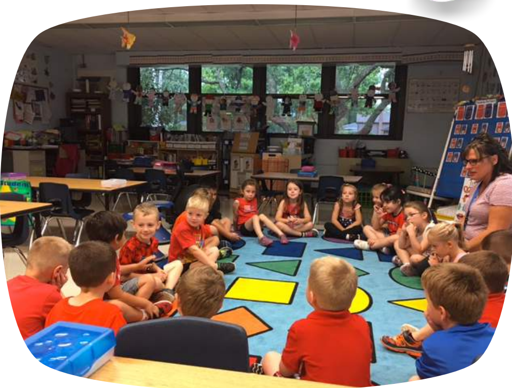
Kindergarteners greeting each other "Good Morning"